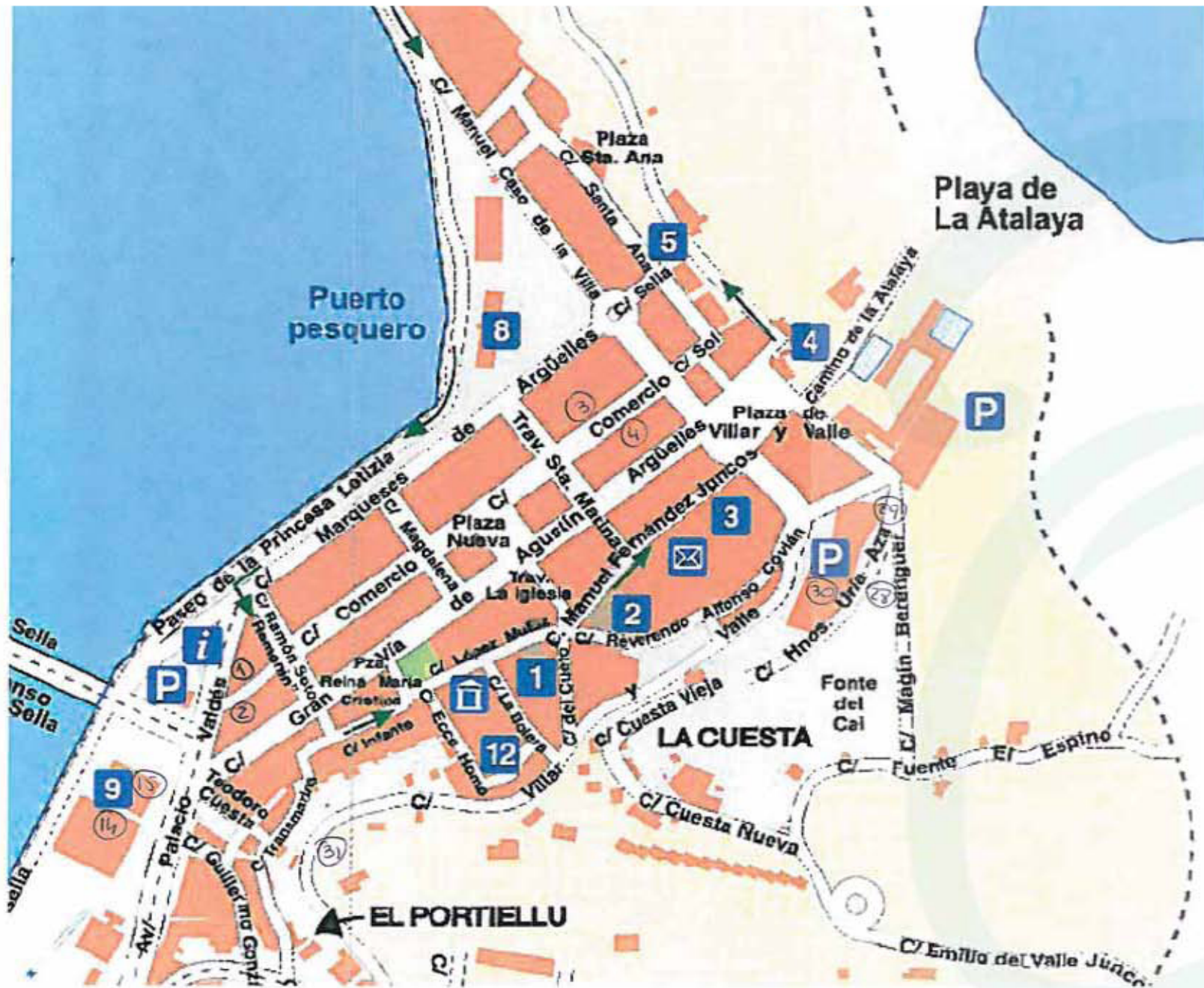
PLANO N° 1